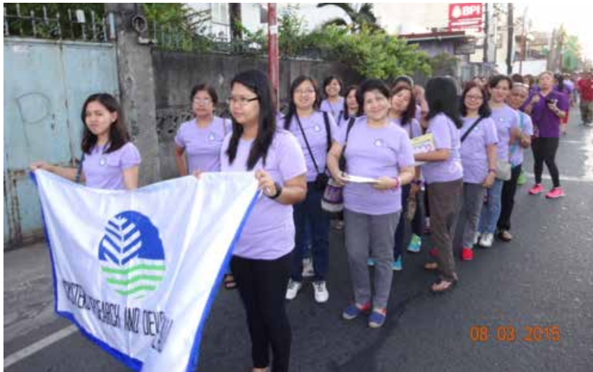
ERDB joins the parade for “Walk for A Cause” in line with Women’s Month Celebration in Los Baños held on 08 March 2015.

Twenty-six (26) ERDB employees participated in the said activity. The different barangays of the Los Baños, government and non-government agencies and organizations also joined the parade. The parade started at 6 o’clock in the morning from Olivarez Town Mall to the Ecological Park of Los Baños.