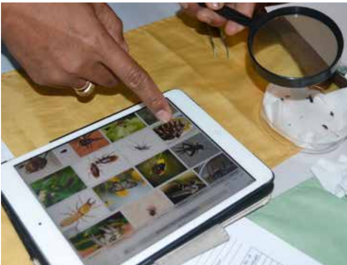
Part of baselining protocol is the assessment of existing arthropods in an area before tree planting activities.

The baselining protocol for the National Greening Program (NGP) was unveiled in a national training held on February 23-27, 2015 at ERDB.