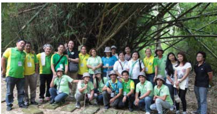
The participants and organizers of Lakbay Aral at the Los Baños Experiment Station.