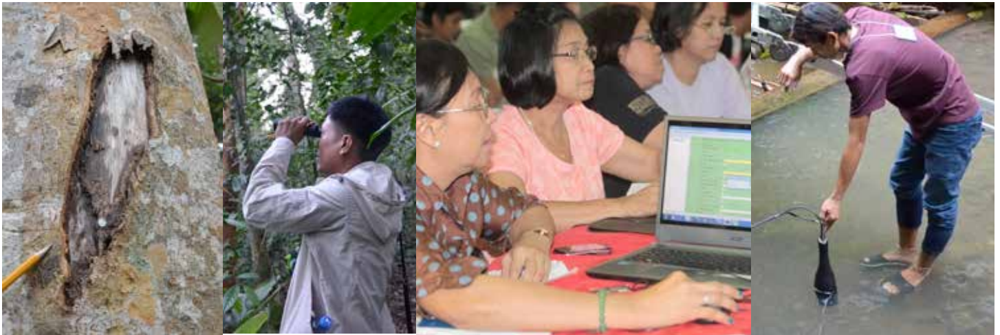
Baselining is not easy. It involves backbreaking physical and mental activities, such as (from left) insect pest and disease identification, avifaunal assessment, socio-economic survey, and water quality assessment